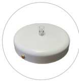
Off-white powder coated rose