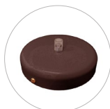
Dark bronze rose