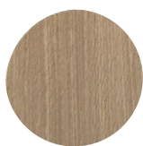
Solid European oak with a white oil finish