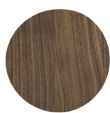
Solid black American walnut with a clear oil finish