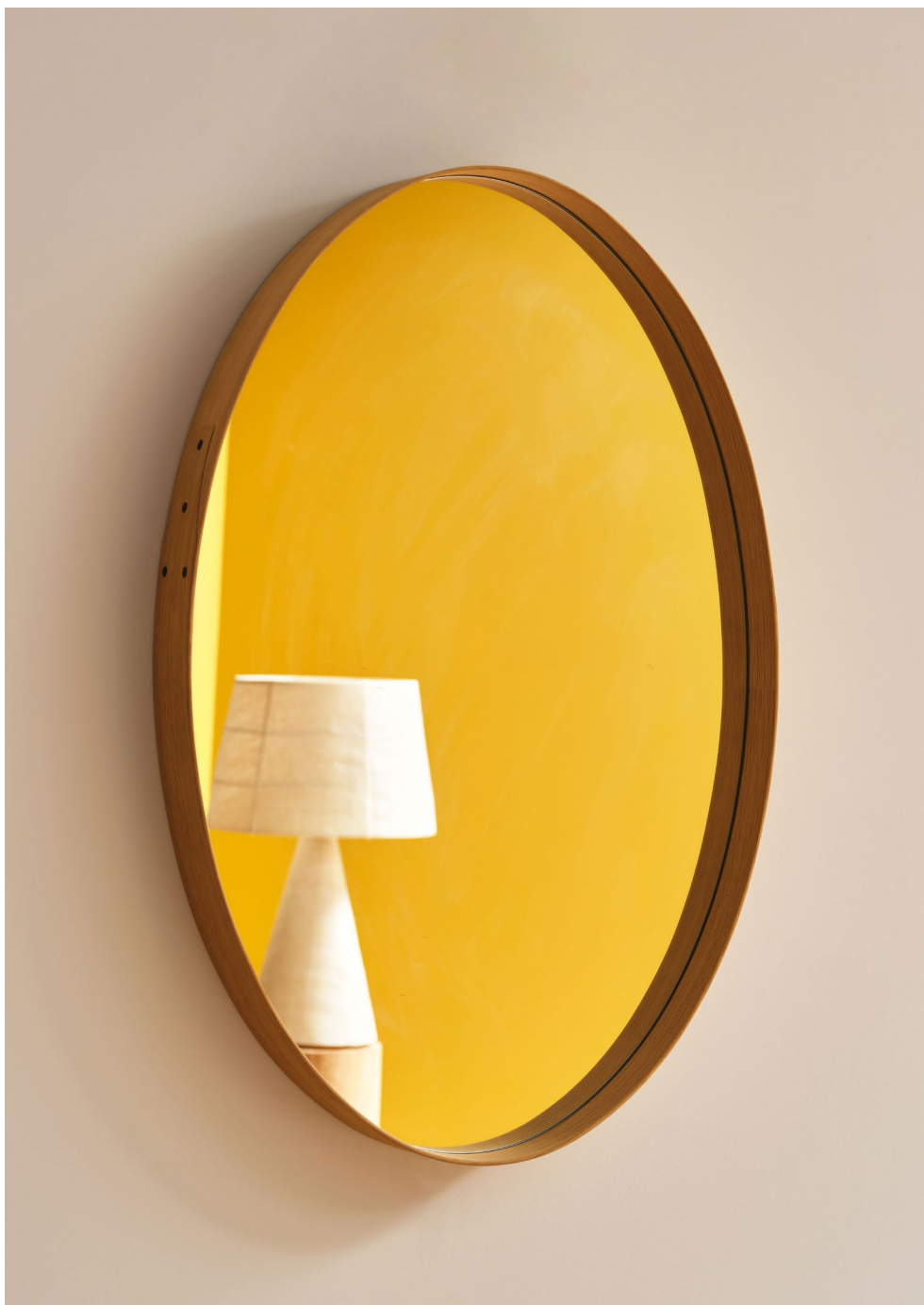
Iona medium mirror