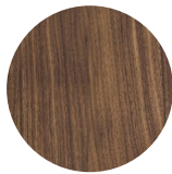
Solid black American walnut clear oil finish