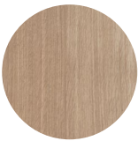
Solid European oak white oil finish