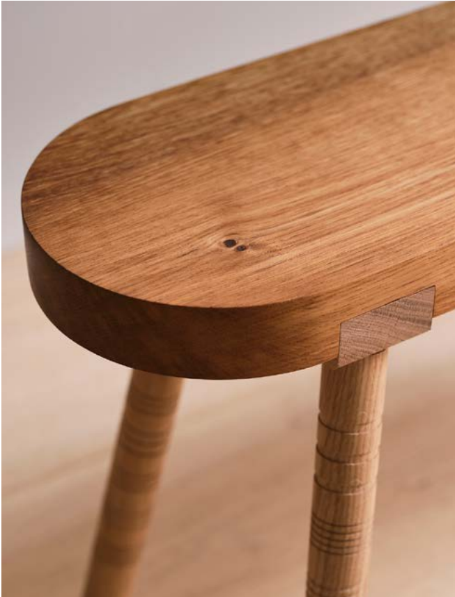
Ort bench Brown oak top Oak legs